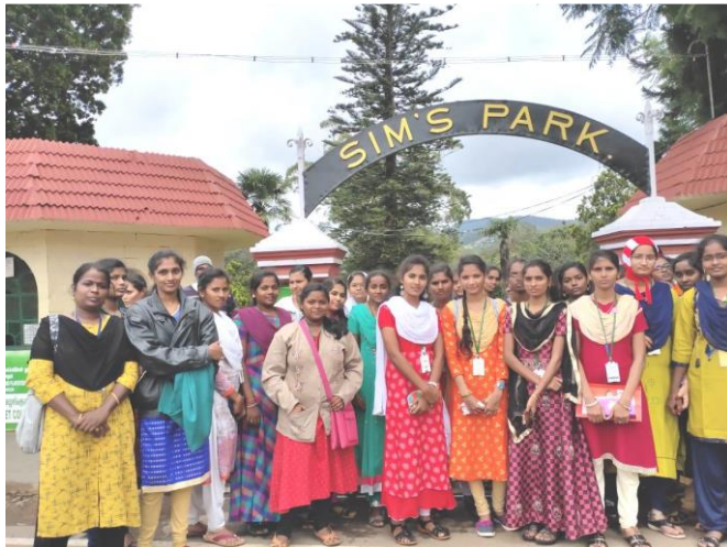
At Sim's Park, Coonoor

Students from II and III B.Sc., Microbiology had an Industrial Visit cum Tour to Pasteur Institute of India, Coonoor on 05.09.2019.