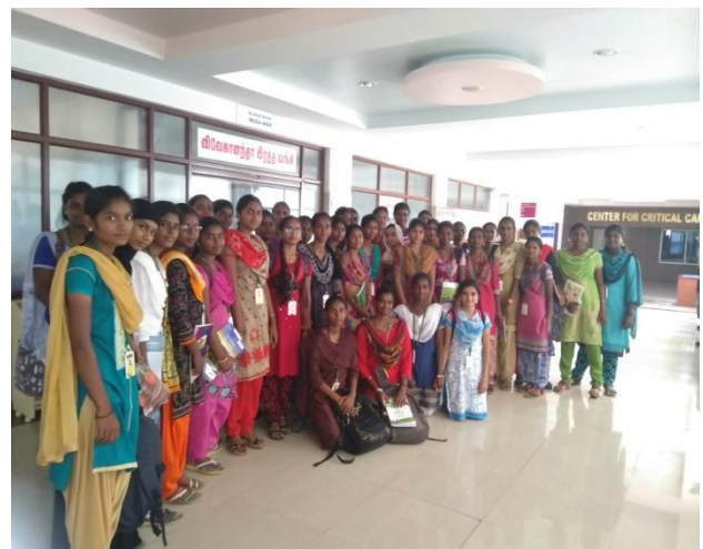
Near Blood bank