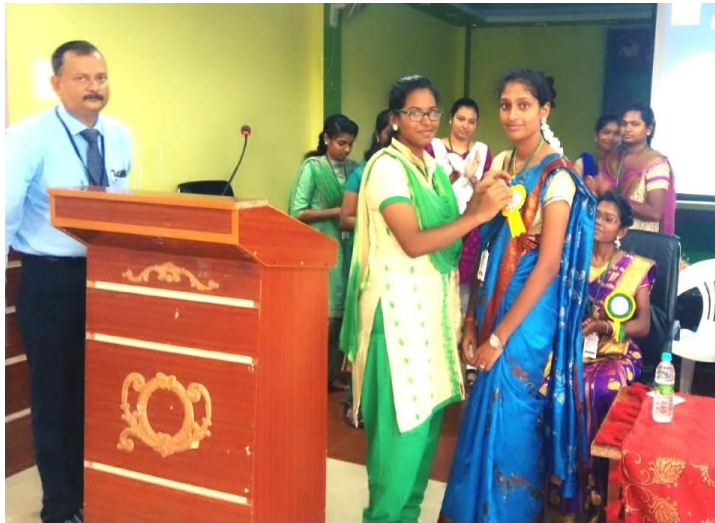
Honouring of the new office bearers of the Club by the office bearer of the academic year 2018-19.

Pasteur Club for the academic year was inaugurated and the first Club activity Microtalentia 2019 was organized on 31.07.2019