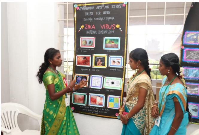
Our I B.Sc., Microbiology Student presenting poster