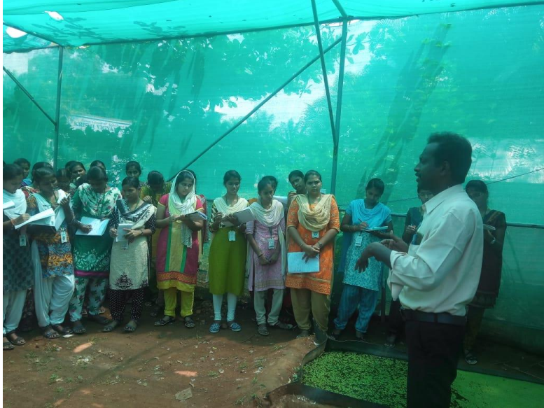
Students visiting Azolla Cultivation

Our II and III B.Sc., Microbiology Students along with the Students of Biochemistry Department in an Industrial Visit to ICAR Institute, Krishi Vigyan Kendra, Gobichettipalayam on 09.10.2019.