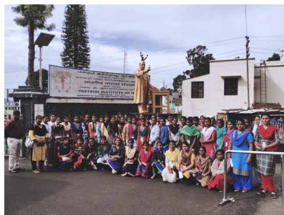
At Pasteur Institute of India