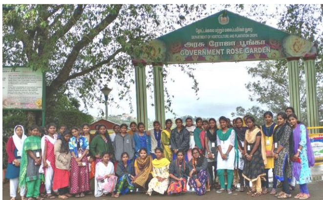
At Rose Garden