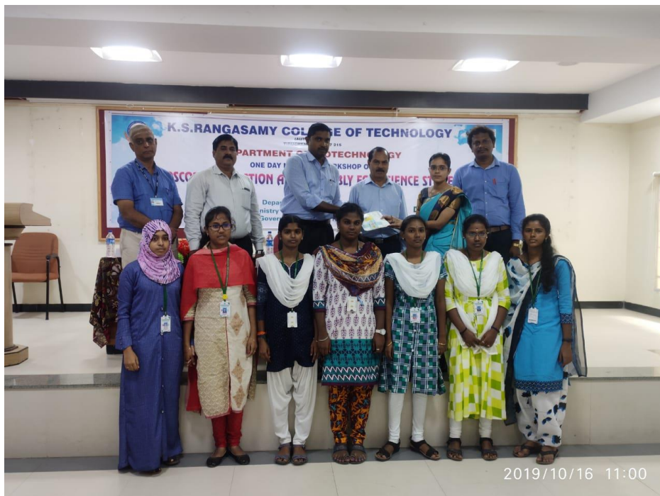
Our I B.Sc., Microbiology Students participated in the Workshop on Foldscope Utilization organized by K.S.R College of Technology.