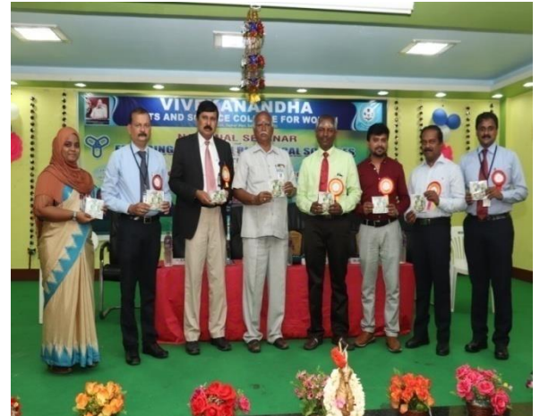
Release of Souvenir