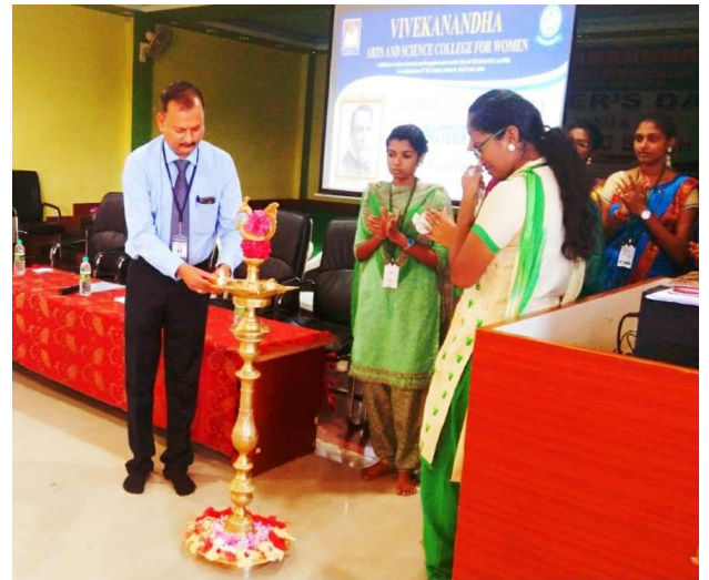
Lighting of the Holy lamp by our Head Incharge