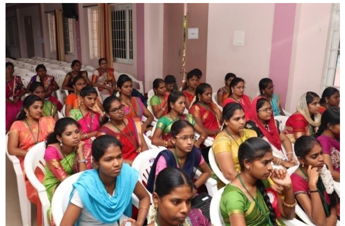
Students at the National Seminar