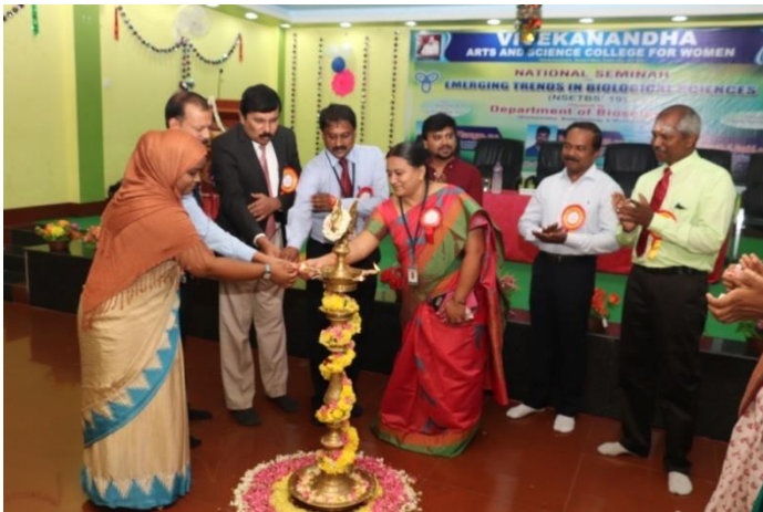
Lighting of the Holy lamp by the Dignitaries

Organized by the Department of Biosciences (Biochemistry, Biotechnology and Microbiology) on 27.09.2019.