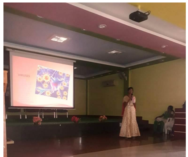
Paper presentation by our Students