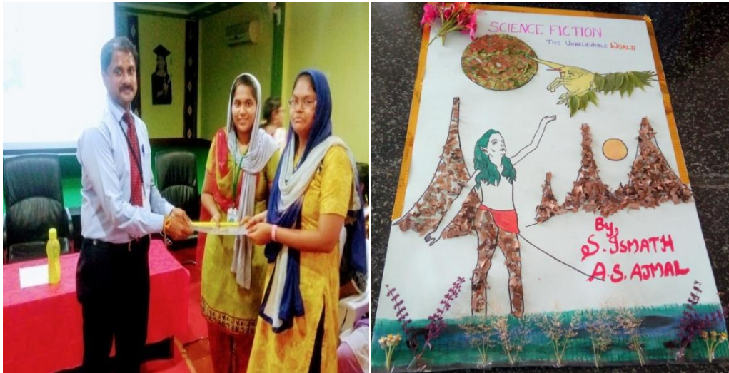
Leaf art by our II B.Sc., Microbiology at the Club Activity organized by the Department of Biotechnology, VIAAS