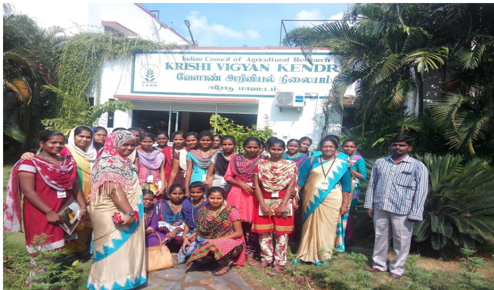
Students of II B.Sc & III B.Sc Biochemistry @ KVK, Gobichettipalayam on 09.10.2019