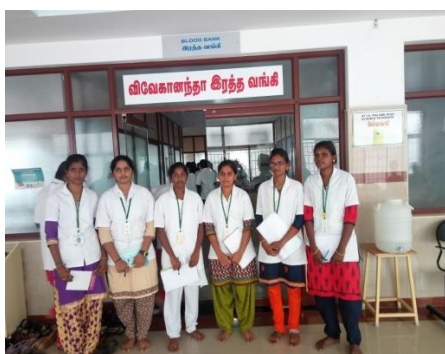
Students @ Vivekanandha Blood bank