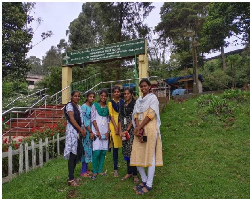
Industrial Visit cum Educational Tour to Pasteur Institute, Coonoor & Ooty on 05.09.2019