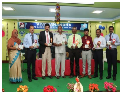
Lighting the Holy lamp & the release of Souvenir by the Dignitaries at the National Seminar on Emerging Trends in Biological Sciences on 27.09.2019