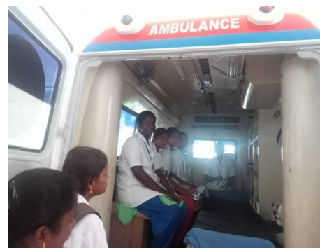
Inside Hi Tech Ambulance @ VMCH