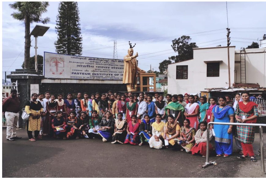
Students of Biochemistry & Microbiology @ Pasteur Institute, Coonoor, Ooty on 05.09.2019