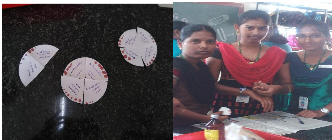
Neuberg Club Activity – I on Clinical Analysis of blood @ Biochemistry Laboratory on 17.07.2019

The Neuberg Club activity –I on Clinical Analysis of blood was organized on 17.07.2019. The students did all the primary tests carried out using blood in a typical diagnostic laboratory.