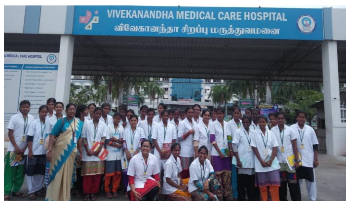
I & II B.Sc STUDENTS OF BIOCHEMISTRY @ VMCH ON 26.07.2019

I B.Sc& II Biochemistry Students (40 members) visited Vivekanandha Medical Care Hospital (VMCH), Tiruchengode on 26.07.2019 as a part of their Industrial visit.