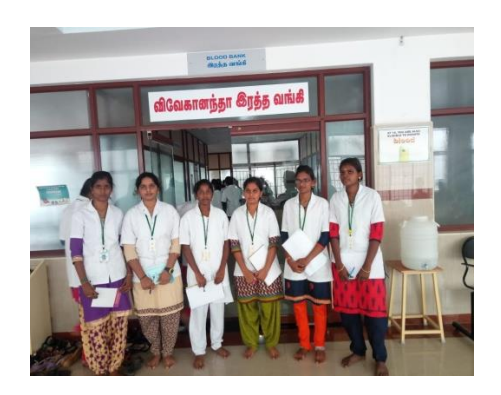
Students @ Vivekanandha Blood bank