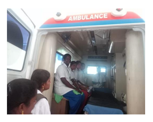
Inside Hi Tech Ambulance @ VMCH