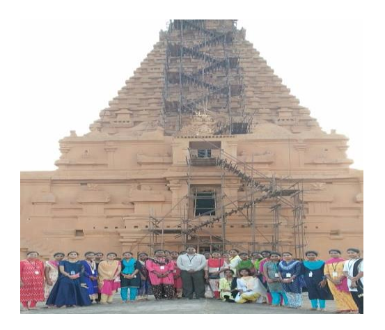
Students @ IIFPT and Tanjore Kovil