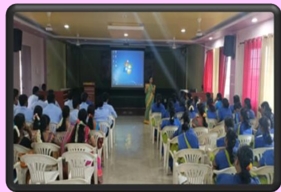
Sensitization Programme about worksheets of Mutual fund Investments for Faculties