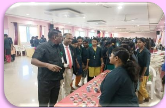
Business Expo Cum Sale