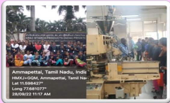
Industrial Visit to SPAC, Poonachi