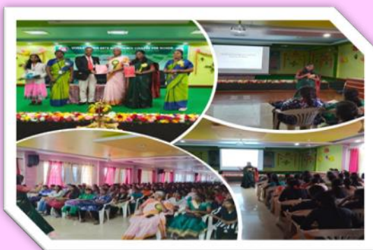
National Level Conference On AI For Sustainable Development Challenges and Opportunities