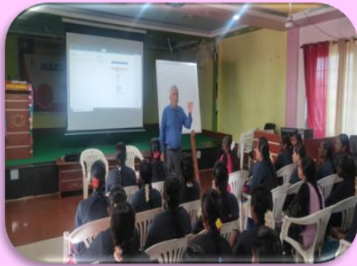
Workshop on Tally