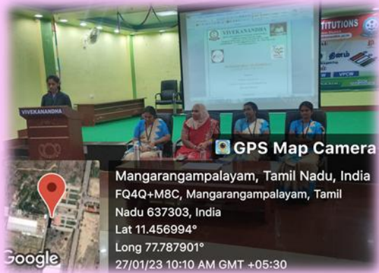
Awareness Programme on Gender Violence by Criminal Law