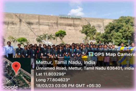
One Day Picnic to Mettur Dam