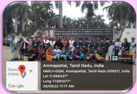
Industrial Visit to SPAC, Poonachi