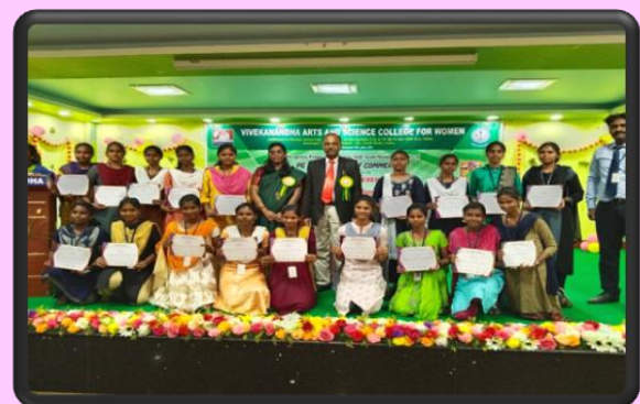
Workshop on Financial Planning For Young Investor and Commodity Market