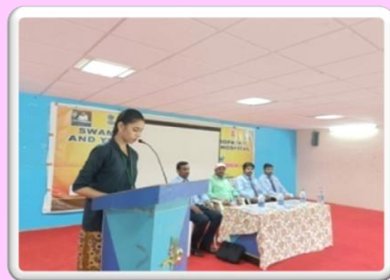
CA Awareness Programme