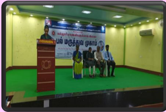
Workshop on Financial Planning for Young Investor and Commodity Market