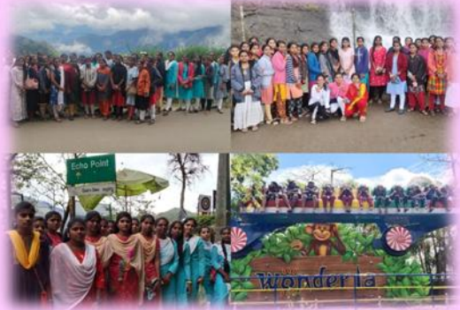
Educational tour to Wonderla