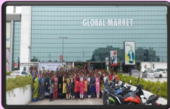
Entrepreneurship Development Cell out Reach Program