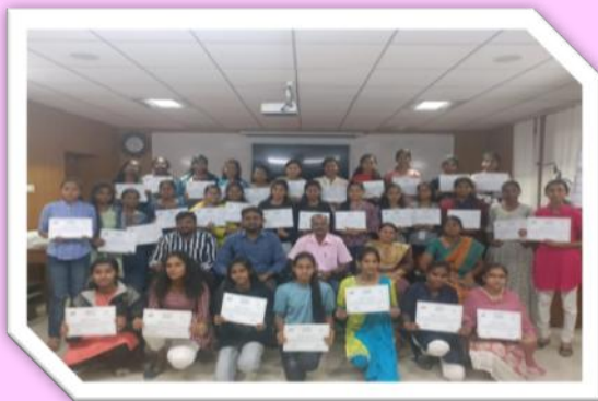
Internship Training National Power Training Institute_-Bangalore