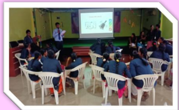
Club Activity_ Business Quiz and Connection