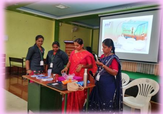
Awareness Programme on Sanitary Napkin