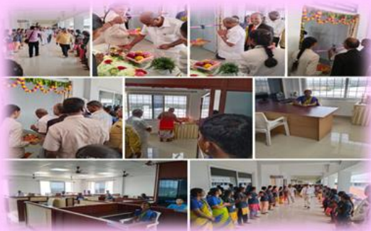
Department Inauguration Ceremony