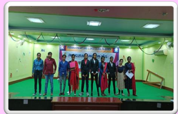
Club Activity - Corporate Show