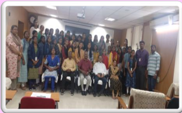
Internship Training National Power Training Institute - Bangalore