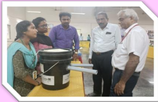
EDII Tamilnadu Project Expo at Periyar University