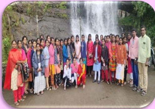
Educational tour to Munnar