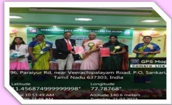
National Level Conference On AI For Sustainable Development- Challenges and Opportunities