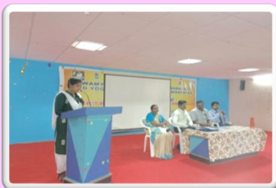
Awareness Programme on "Career Guidance & Opportunities for Company Secretary"